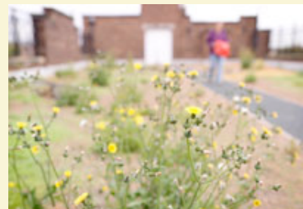
The newly installed green roof at Toxteth TV building

Green roofs are recognised as having tangible economic and environmental benefits and this is just one of several within Liverpool. For more information about the buildings with a green roof visit the Biodiversity & Socio-Economics area at www.naturaleconomynorthwest.co.uk/resources+reports.php