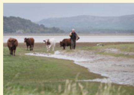
Bill Grayson, grazier, with 'flying' herd at Arnside

The current grazier is set to reduce their involvement in the scheme by 2012, but a loss of grazing impacts on jobs, land value, tourism, climate and other benefits within the 11 identified by Natural Economy Northwest as deriving from the natural environment.