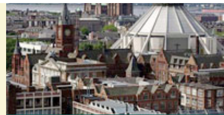
Rooftops across the Liverpool Knowledge Quarter: Nick Roche, TMF

To find out why a green roof need not be green, to explode myths about green roofs and to discover why they have a significant role to play within the NW Climate Change Action Plan, visit the Biodiversity & Socio-Economics area at www.naturaleconomynorthwest.co.uk/resources+reports.php