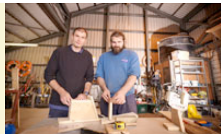
Participants learning to build bat boxes at Brockholes.

The project was established with funding from SITA Trust's Enriching Nature Programme and organised by the Wildlife Trust for Lancashire, Manchester and North Merseyside. NENW contributed enhancement funding to optimise the Green Infrastructure benefits and maximise the positive impact on the local economy and community.