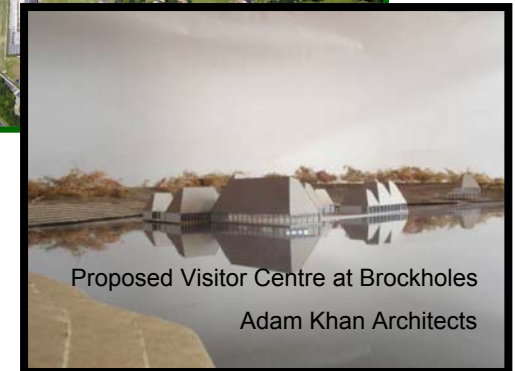
Proposed Visitor Centre at Brockholes Adam Khan Architects